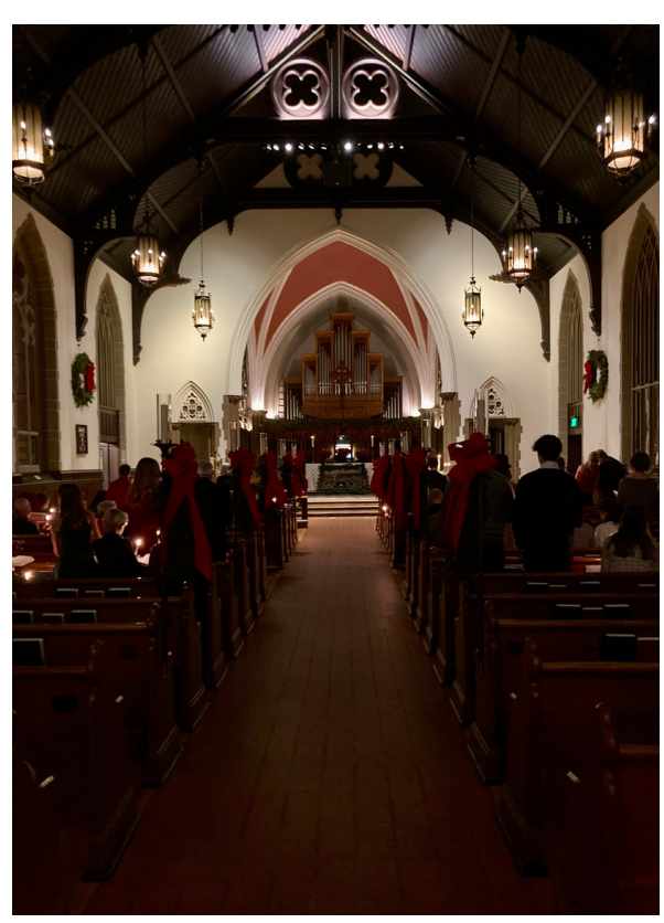
A big thanks to our very talented Altar Guild and acolytes for decorating the nave and setting up the creche. Their hard work helped to elevated our worship.