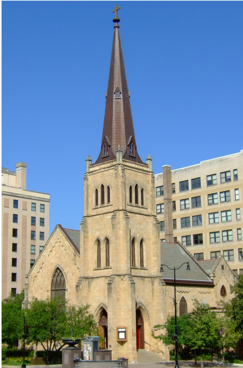
A Historic Church on the Capitol Square since 1838.

Grace Episcopal Church 116 W. Washington Avenue, Madison, WI 53703 (608) 255-5147 www.gracechurchmadison.org